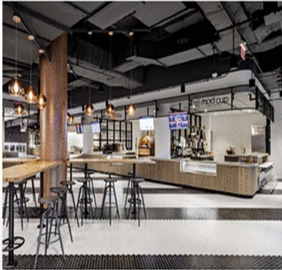
District Kitchen, Harborside 2 & 3 Jersey City, NJ

Mack-Cali's office portfolio strives to achieve the highest possible rents in select markets with a continuous focus on improving the quality of our portfolio.