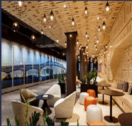
Harborside 2 & 3 - Jersey City, NJ