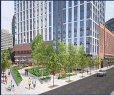
The Charlotte - Jersey City, NJ (In-Construction)