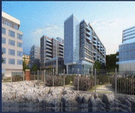
RiverHouse 9 - Weehawken, NJ (In-Construction)