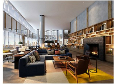
The Capstone (Riverwalk C), West New York, NJ (rendering)